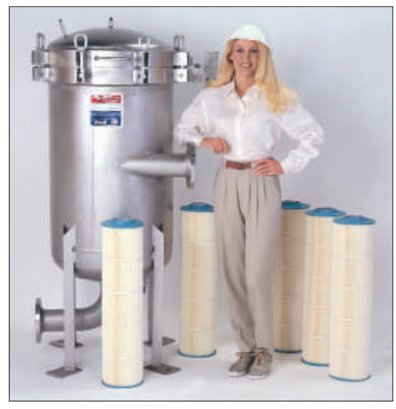
Harmsco HUR-850-ASME filter

POLY-PLEAT <sup>™</sup> Cartridges are ideal for municipal water filtration using Harmsco's HUR-850-ASME filter housing shown below.